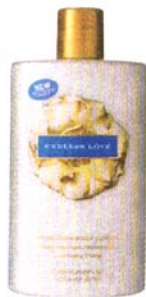
VICTORIA'S SECRET SECRET GARDEN COLLECTION HYDRATING BODY LOTION IN ENDLESS LOVE, $9, VICTORIASSECRET.COM