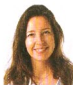
CALYPSO CHRISTIANE CELLE MIMOSA BODY LOTION, $30, CALYPSO-CELLE.COM

The most flattering fall shapes and how to wear them