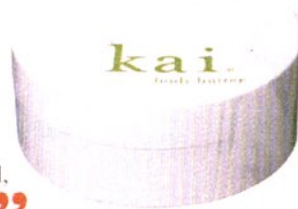
KAI BODY BUTTER, $55, KAIFRAGRANCE.COM FOR STORES